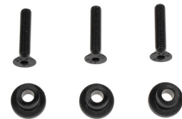
QL3.1 studs (incl.)