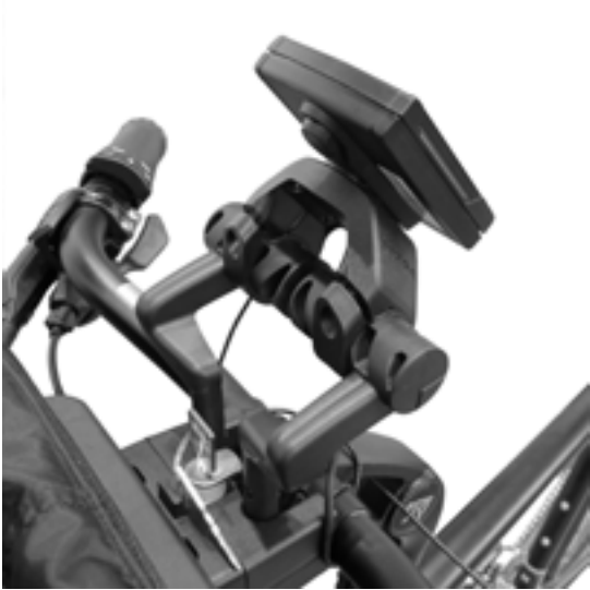
Mounting of E-bike display