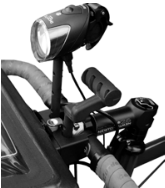
Mounting of bike light