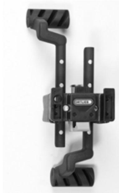
Optional mounting position