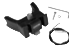
E226 Handlebar Mounting-Set E-Bike