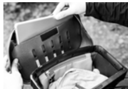
Opening lid compartment: 20,5cm / 8.1in.