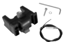
E225 Handlebar Mounting-Set