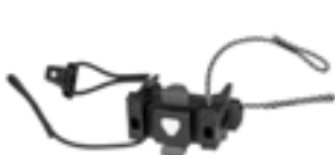
E241 Handlebar Mounting-Set QR

Handlebar mounting-set (sold separately):