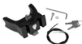
E207 Handlebar Mounting-Set E-Bike with Lock