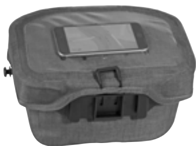
Smartphone in transparent lid compartment (not included)